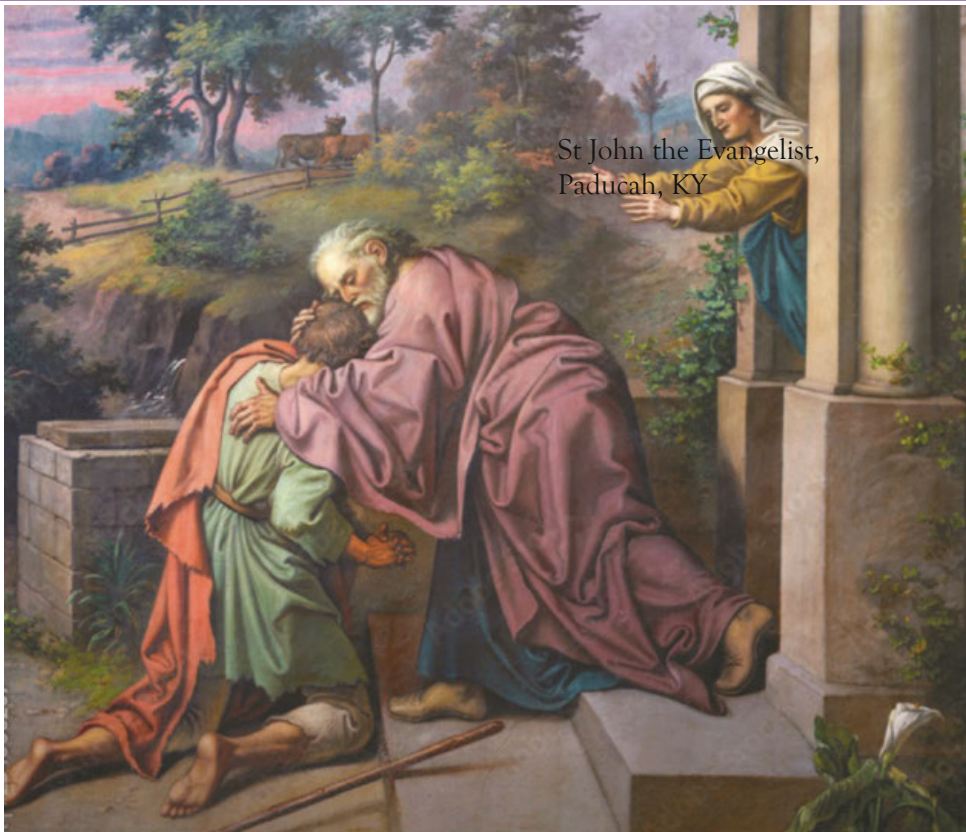
St John the Evangelist, Paducah, KY